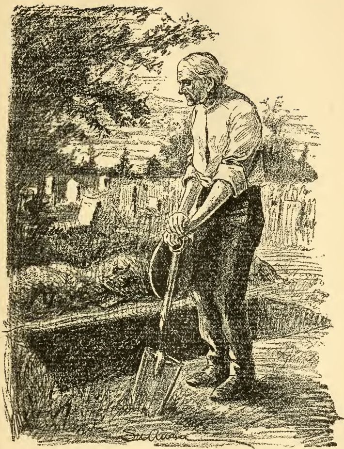
"The sexton leant on his spade"